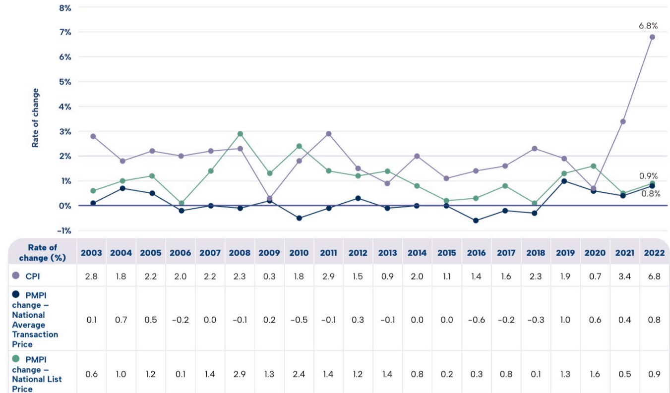
FIGURE 19. ANNUAL RATE OF CHANGE, PATENTED MEDICINES PRICE INDEX (PMPI) AND CONSUMER PRICE INDEX (CPI), 2003 TO 2022

Note: To account for revised submissions from rights holders, price and quantity indices are recalculated for the five years preceding the current Annual Report year. If the data has been revised, the values reported here may differ from those presented in earlier Annual Reports.